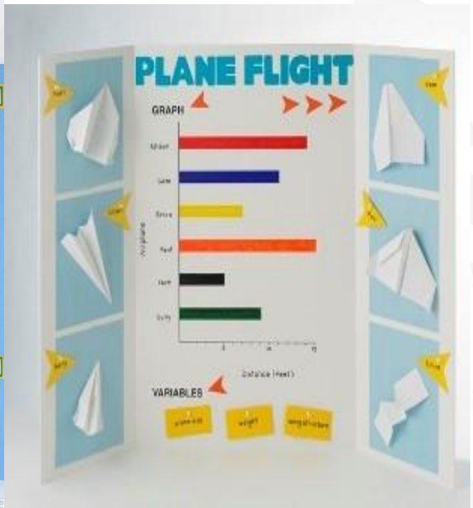
Paper Plane testing