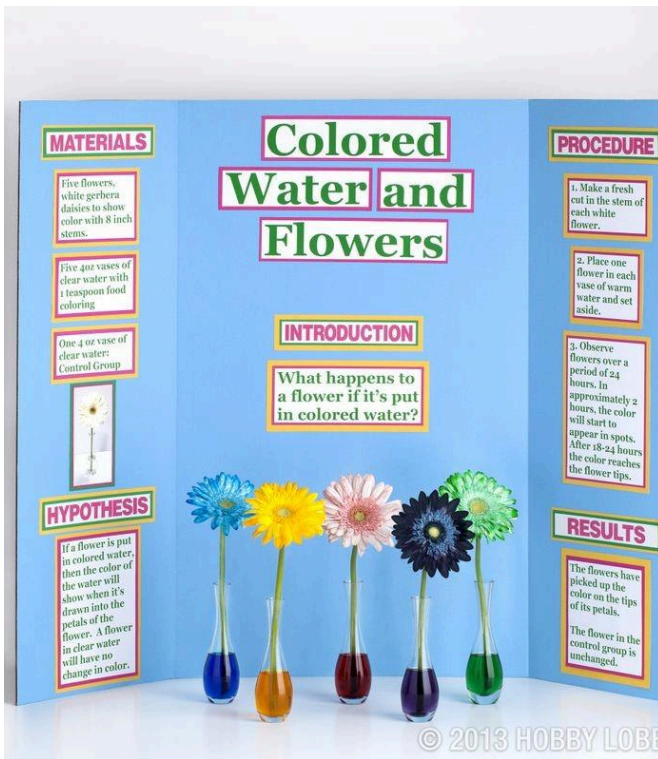
Flowers and coloured water showing capillary action