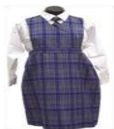
Pinafore (Prep-Year 4) Size: 4 Sizes: 6-8 Sizes: 10-12 Sizes: 14-16