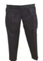
Winter Trousers (Full Elastic or Zip-Fly) Sizes: 4c-18y Colour: Bizcharcoal