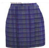
Winter Skirt (Year 5&6) Sizes: 8-10-12 Sizes: 14-16-18 Size: 20