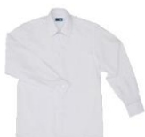
Winter Long Sleeve Shirt Sizes: 4c-18c Colour: White