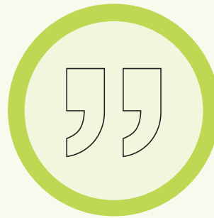
Conventions of language (spelling, grammar and punctuation)